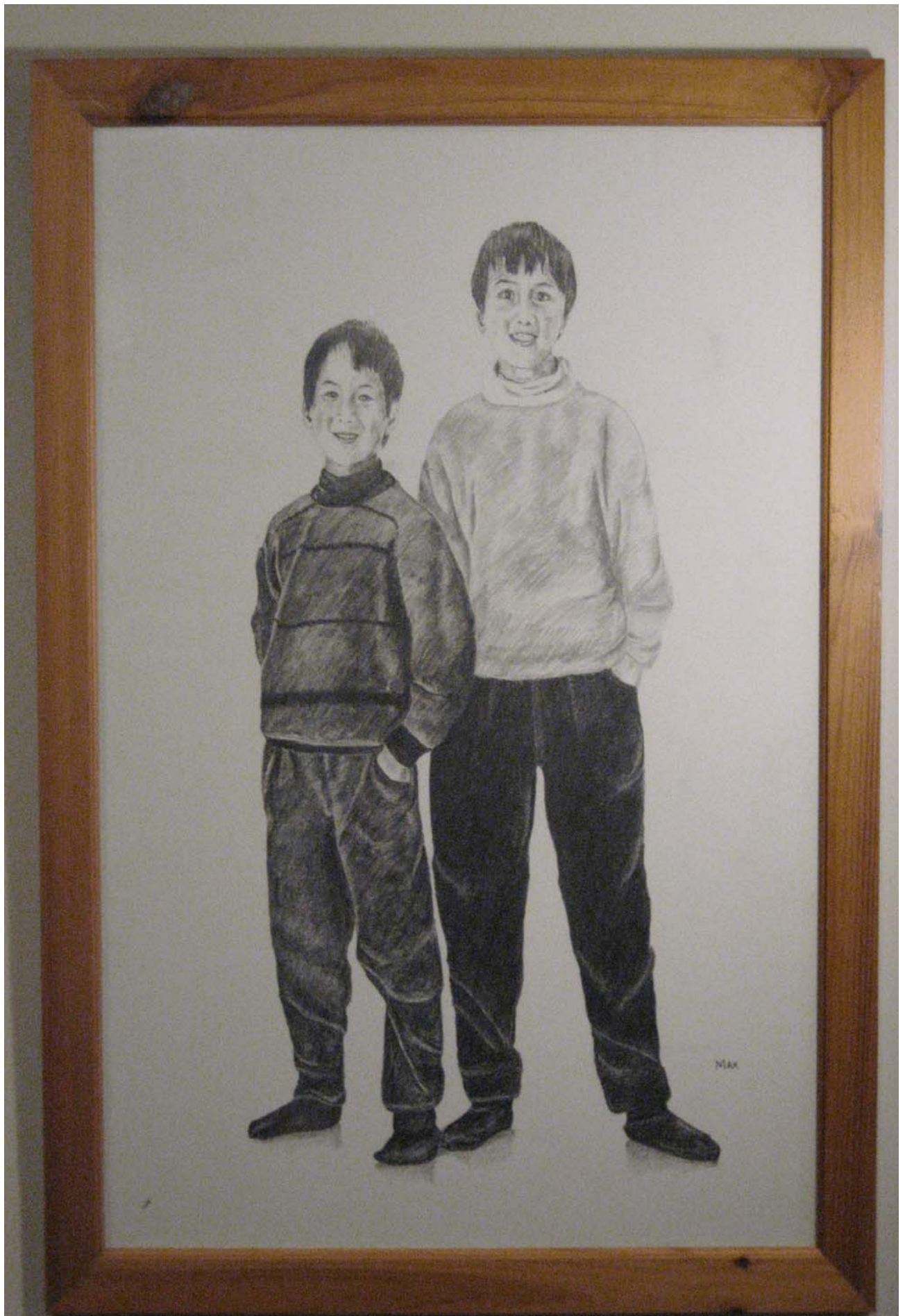
My Boys at 10 and 8. 1996