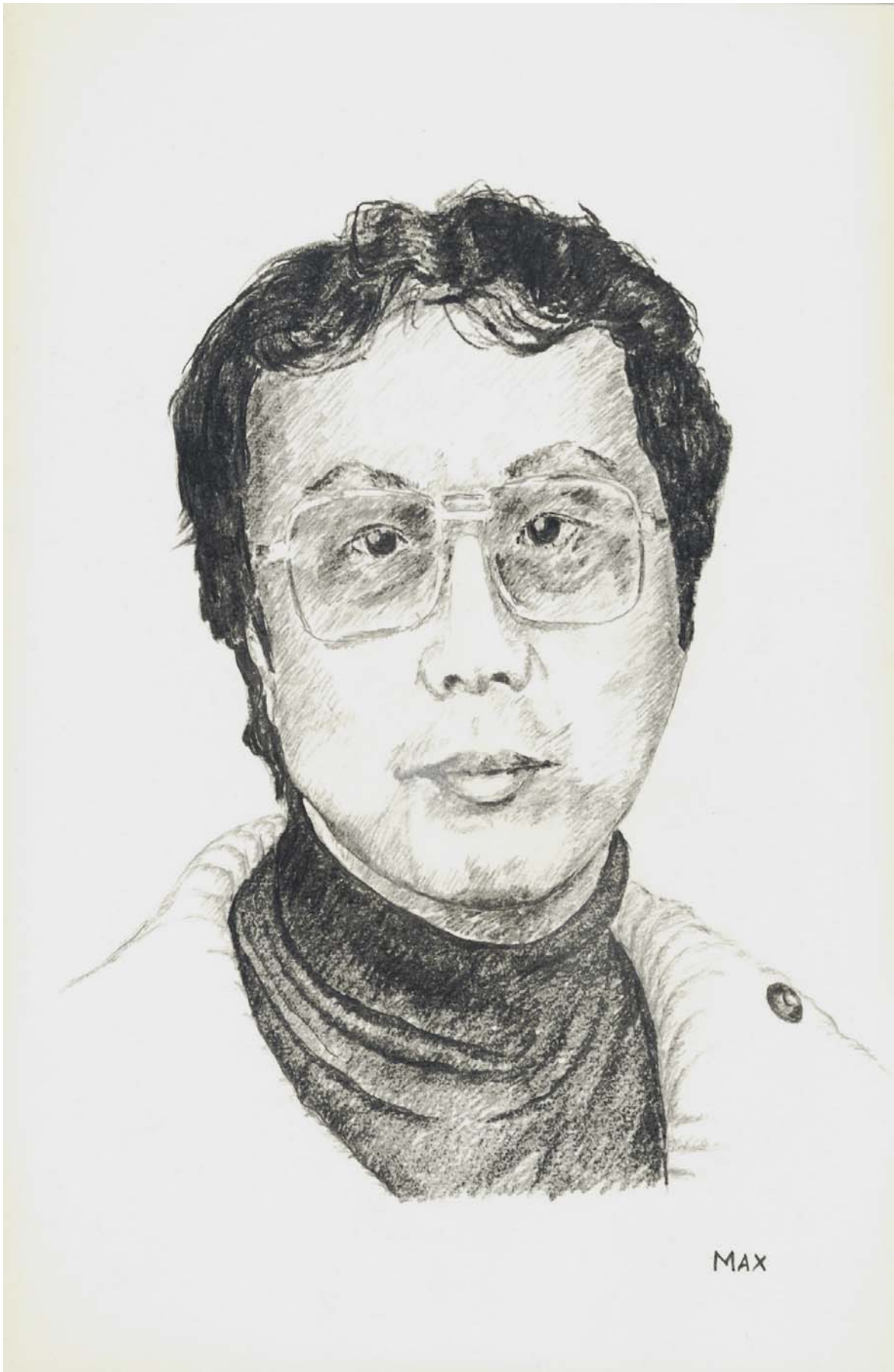
Self Portrait, 1985