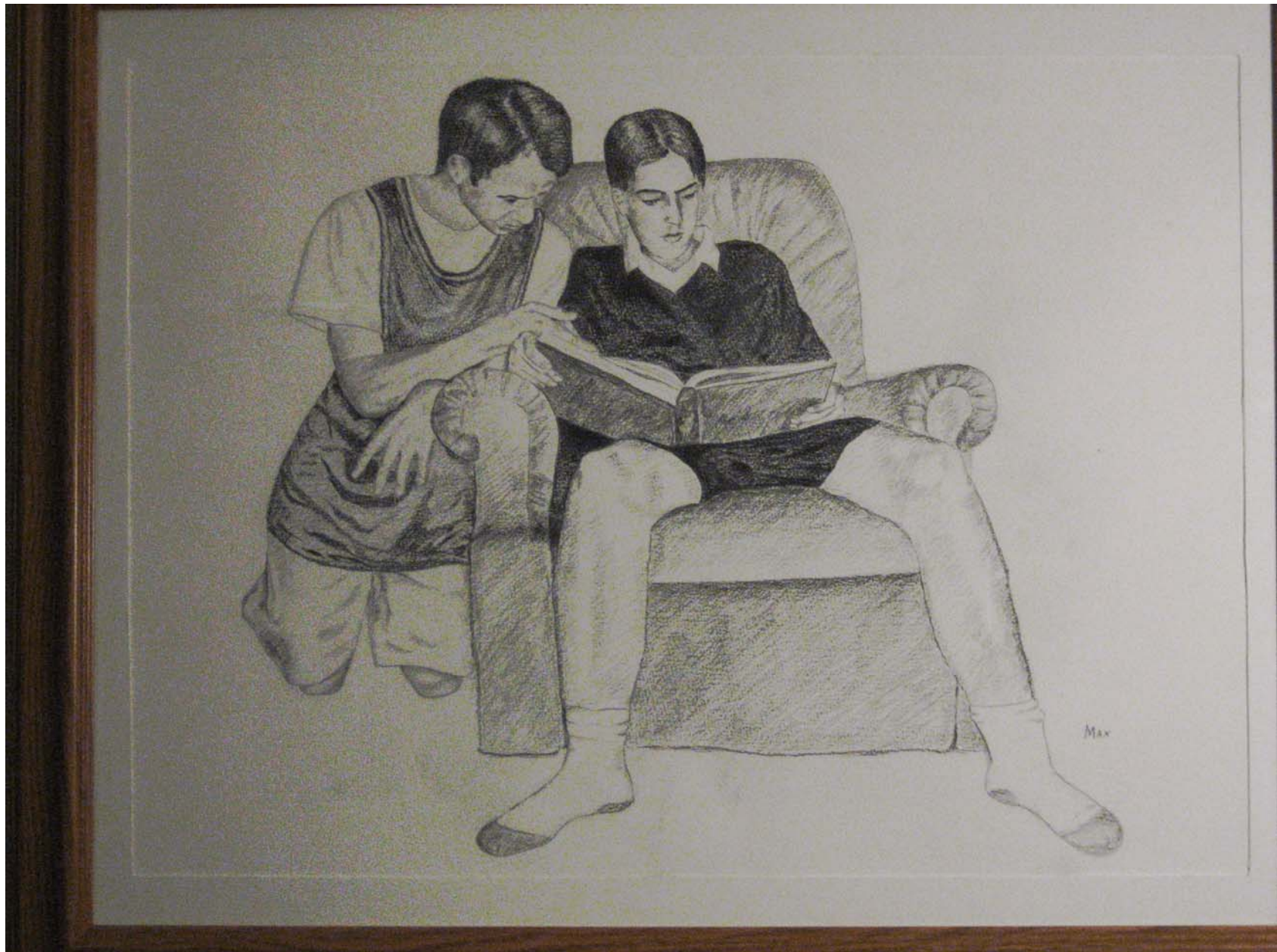
My Boys at 16 and 14, 2002